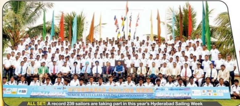
ALL SET: A record 239 sailors are taking part in this year's Hyderabad Sailing Week