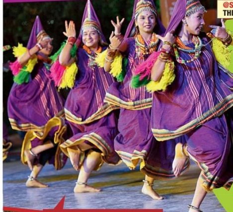
Mathuri dance of Koppu Lambadi tribe and Gussadi dance of the Gonds were staged